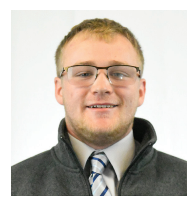
University of Maine

Transportation Infrastructure Durability Center (TIDC)