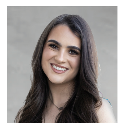
Texas A&M University

Center for Advancing Research in Transportation Emissions, Energy, and Health (CARTEEH) led by the Texas A&M Transportation Institute