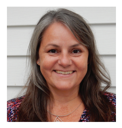
University of Akron

Center for Connected Automated Transportation (CCAT) led by the University of Michigan