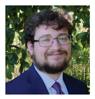
Utah State University

Mountain-Plains Consortium (MPC) led by North Dakota State University