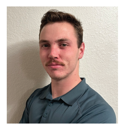
University of Idaho

Center for Safety Equity in Transportation (CSET) led by the University of Alaska Fairbanks