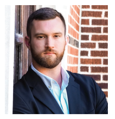
University of Oklahoma

Accelerated Bridge Construction (ABC-UTC) led by Florida International University