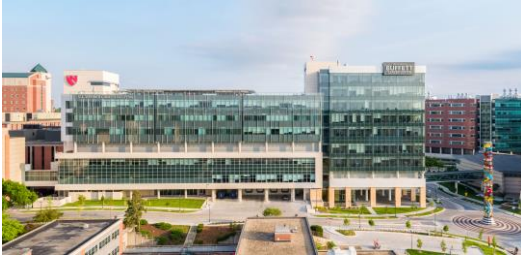
Fred & Pamela Buffett Cancer Center