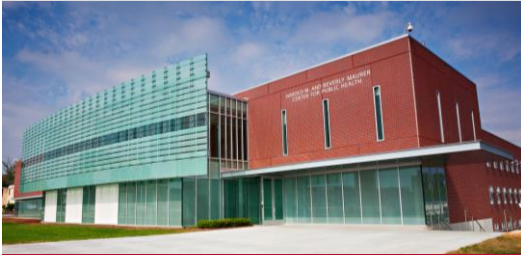
UNMC College of Public Health