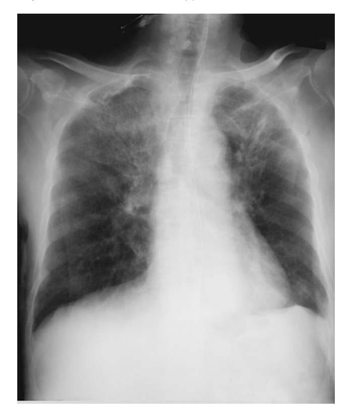
Figure 1. Chest radiography in an 85-year-old man with bilateral extensive aspiration pneumonia and glottic dysfunction. Reprinted with permission from Janssens JP, Krause KH. Pneumonia in the very old. Lancet Infect Dis 2004;4(2):112-24.