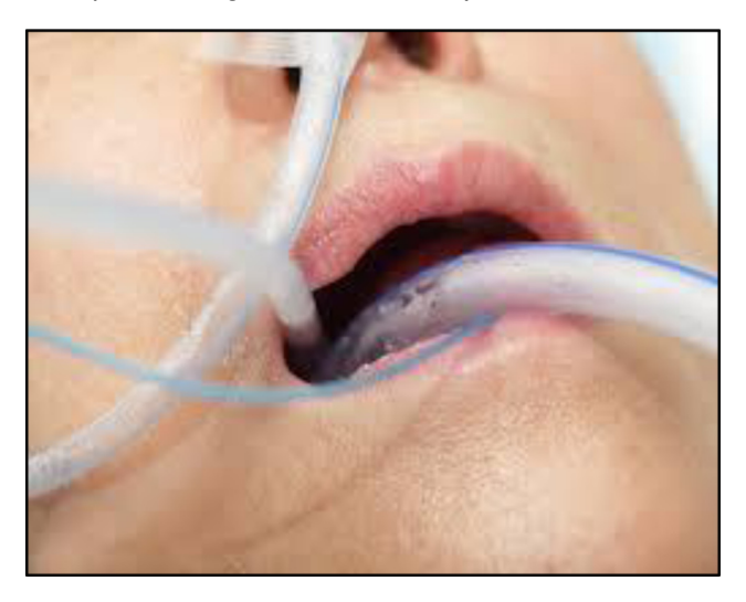
Figure 3. Illustration of ventilator tubing placement with consequent challenge of oral care delivery.

concerned at her father's nursing home when she found dust on his electric toothbrush. Her father's complaints of oral pain revealed a broken tooth with half of the tooth lodged in his palate. With more elderly individuals retaining natural teeth, more care is needed than was required with dentures in the past.