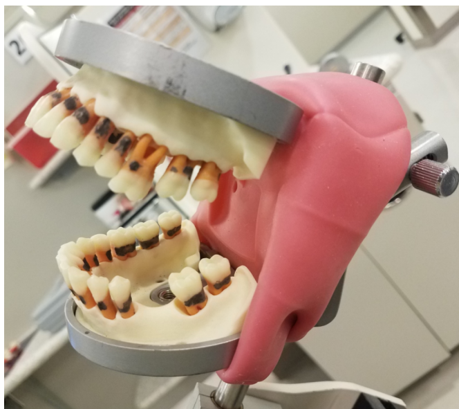
Students learning scaling /root planing on new models with “bad gums.”