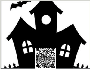
Take your own tour of our haunted hospital. Scan the QR code above.