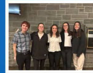
1 st Place Team

Building IPE competencies and preparing students for IPP is an essential component of education in the health sciences. The CC provides students and faculty/staff with opportunities to learn with, about, and from each other and to foster health, well-being, and resilience in our communities.