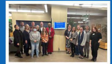
HSHP Faculty, Staff, and Community Partners