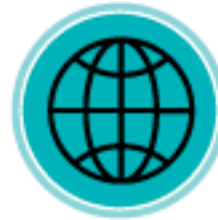
Physical Therapy in Society